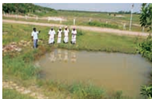
Watershed associations play an important role